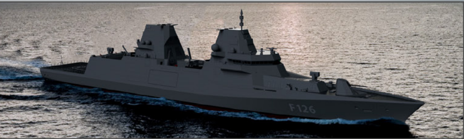
F126 Frigates (as subcontractor) Under construction