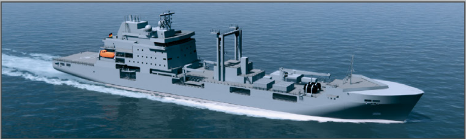
MBV707 Fleet tankers Under construction