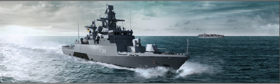
K130 (boats, 6–10) Köln class Corvettes Under construction

Whatever the requirement or the budget, we remain flexible and provide tailored naval solutions from a single source. The breadth of our expertise is demonstrated by our portfolio, ranging from fast patrol boats and offshore patrol vessels to corvettes, frigates, mine countermeasure vessels and logistic support ships.