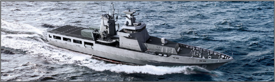
SEA1180 Arafura class Offshore patrol vessels Under construction