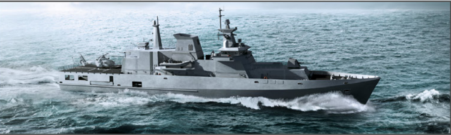
MMPV90 Corvettes Under construction