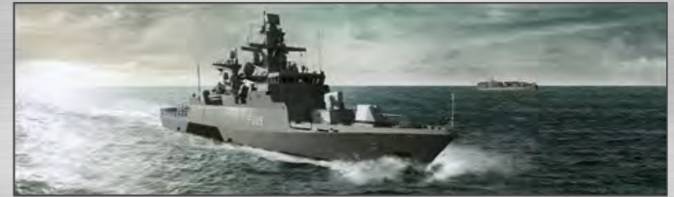
K130 (boats, 6-10) Köln class Corvettes Under construction

Whatever the requirement or the budget, we remain flexible and provide tailored naval solutions from a single source. The breadth of our expertise is demonstrated by our portfolio, ranging from fast patrol boats and offshore patrol vessels to corvettes, frigates, mine countermeasure vessels and logistic support ships.