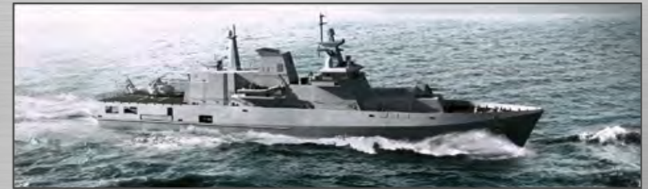
MMPV90 Corvettes Under construction