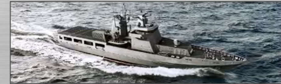
SEA 1180 Arafura class Offshore patrol vessels Under construction