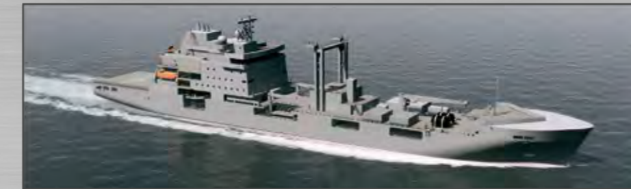
MBV 707 Fleet tankers Under construction