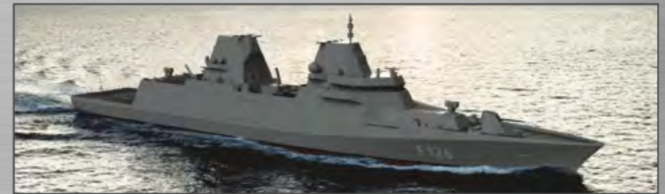
F126 Frigates (as subcontractor) Under construction