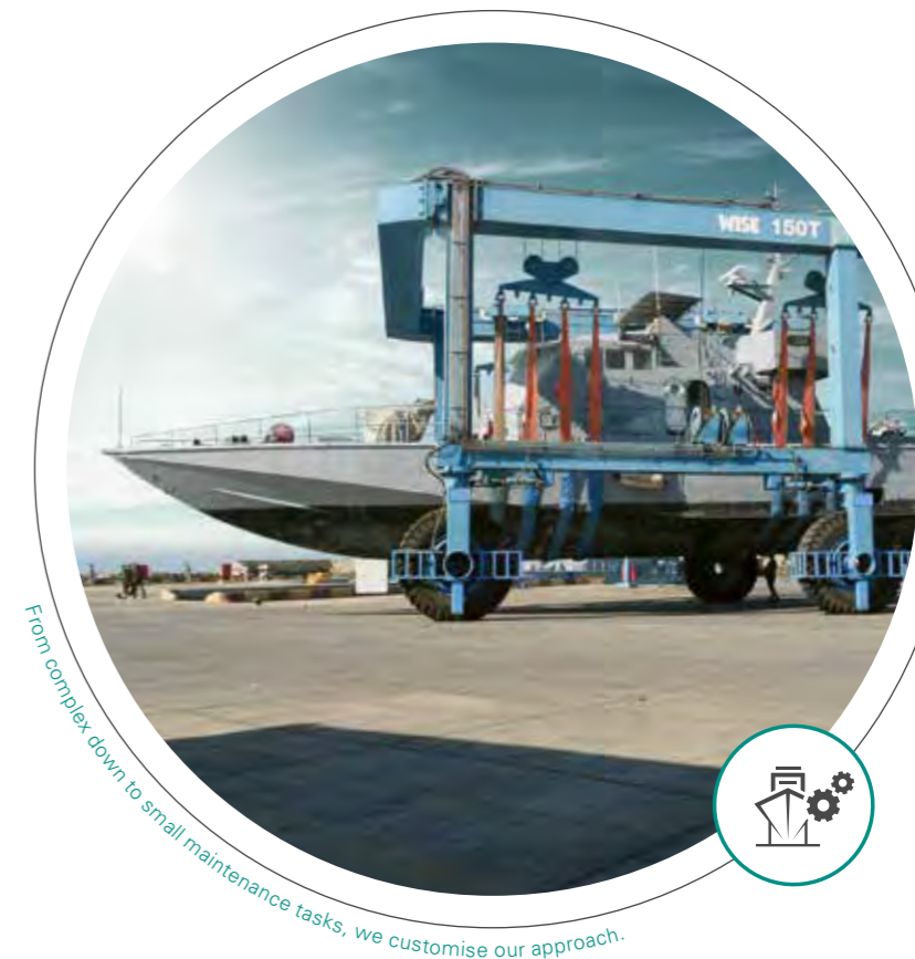
From complex down to small maintenance tasks, we customise our approach.

Implementation is flexible. We can offer a full package that covers all requirements, or simply assist your team with guidance and supervision. they receive the call.