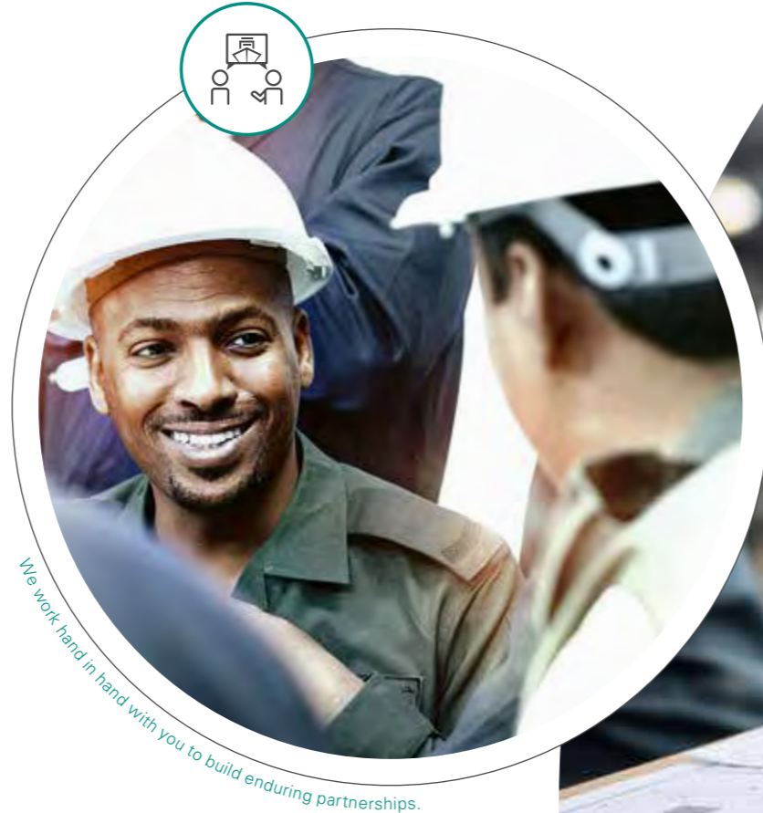
We work hand in hand with you to build enduring partnerships.

We are proud of our reputation for quality and performance, and bring a strong focus on professionalism and teamwork to your fleet.