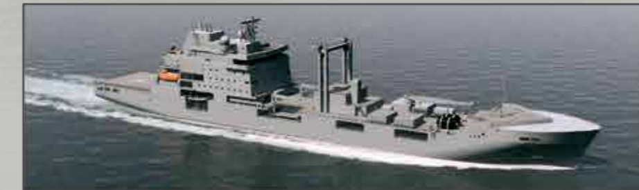
MBV 707 Fleet tankers Under construction