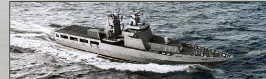
SEA 1180 Arafura class Offshore patrol vessels Under construction