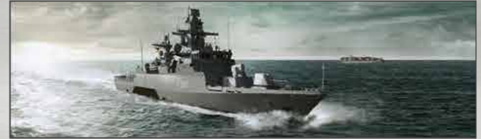
K130 (boats, 6-10) Köln class Corvettes Under construction

Whatever the requirement or the budget, we remain flexible and provide tailored naval solutions from a single source. The breadth of our expertise is demonstrated by our portfolio, ranging from fast patrol boats and offshore patrol vessels to corvettes, frigates, mine countermeasure vessels and logistic support ships.