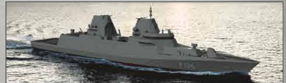
F126 Frigates (as subcontractor) Under construction