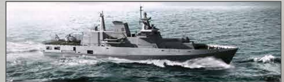
MMPV90 Corvettes Under construction